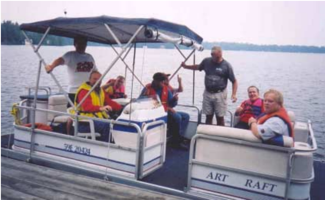
Aktion Club members at their summer get away