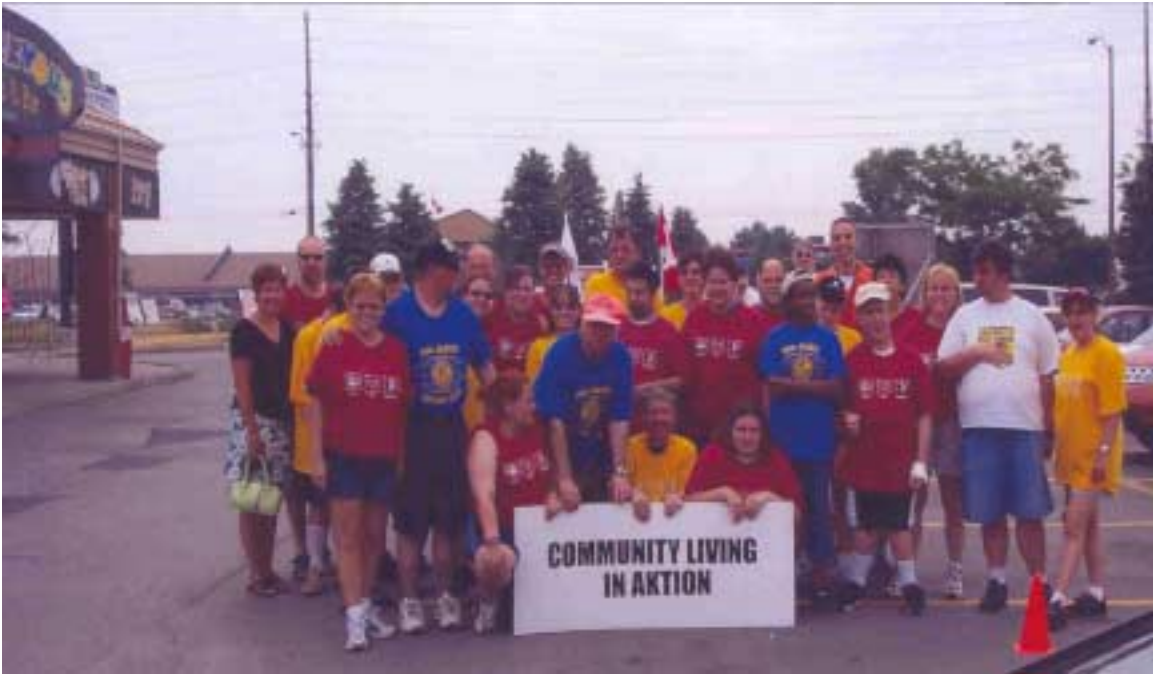
Participants from Community Living Ajax-Pickering and Whitby At the Big Bike event