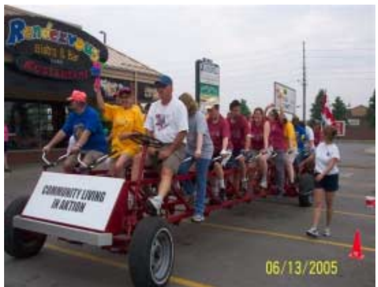
PARTICIPANTS FROM C.L.A.P.W. AT THE BIG BIKE EVENT!