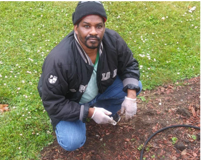
Thanks for contributing to the CLAPW Newsletter, Prince!

Our next edition will be available in January 2019